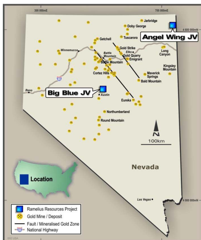
Figure 1: Angel Wing and Big Blue project location map