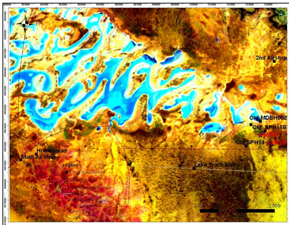
Figure 1. Location of drill holes (Land-Satellite Image)

Figures 1-3 display the location of the planned drill holes M12A and M12B on site at the Mt Barrett project.