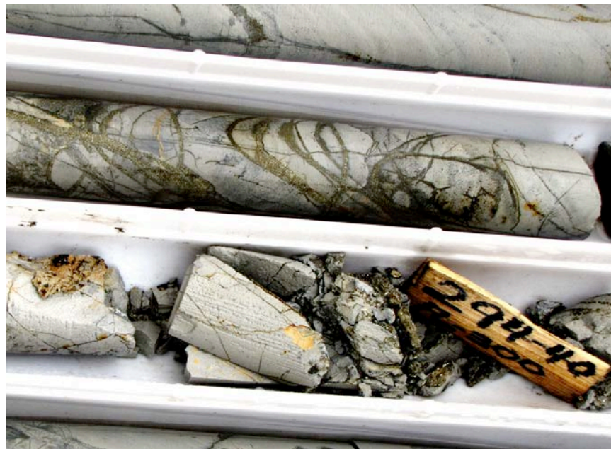
NEV 019: part of 294 to 296m: 2m at 16.43 g/t Au (average of 3 assays)