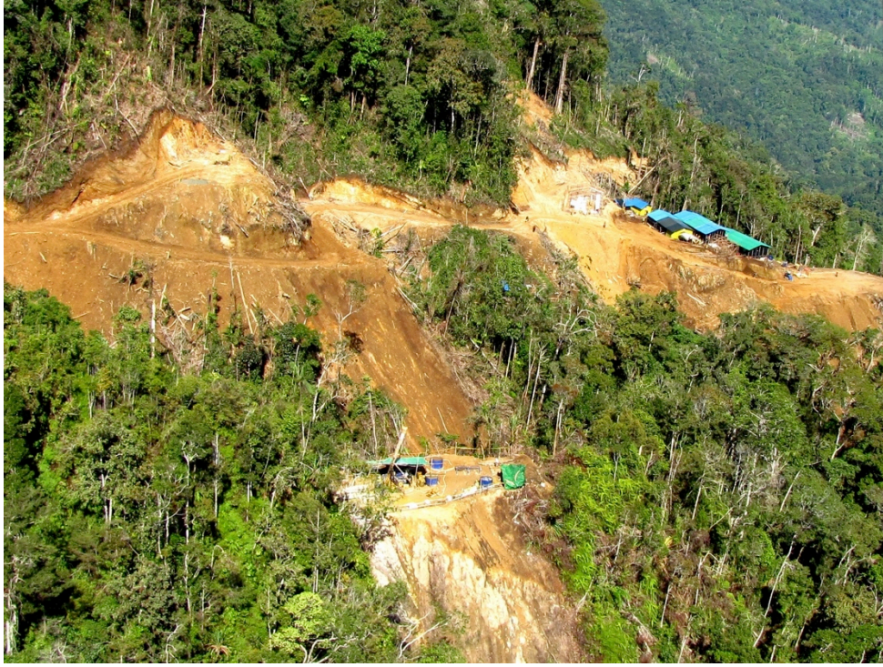
Drill rig on NEV 019 (foreground) with NEV 018 pad (top left) and new top camp (top right)