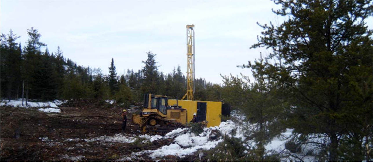
Figure 1: Drilling at Onion Lake during quarter