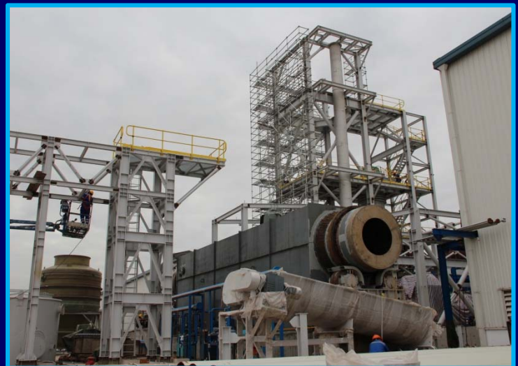
Sodium sulphate dryer