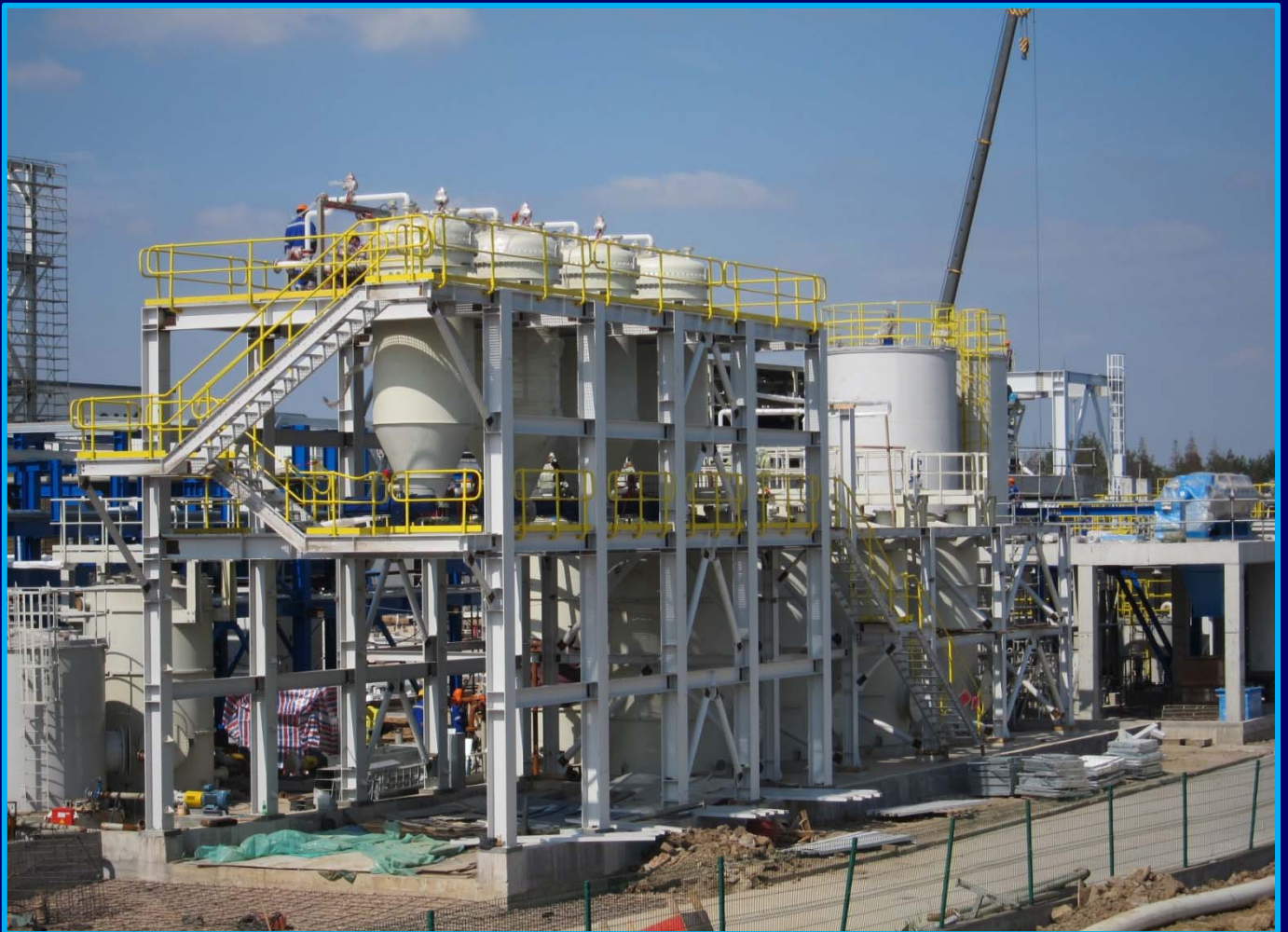
Leaching and impurity removal area