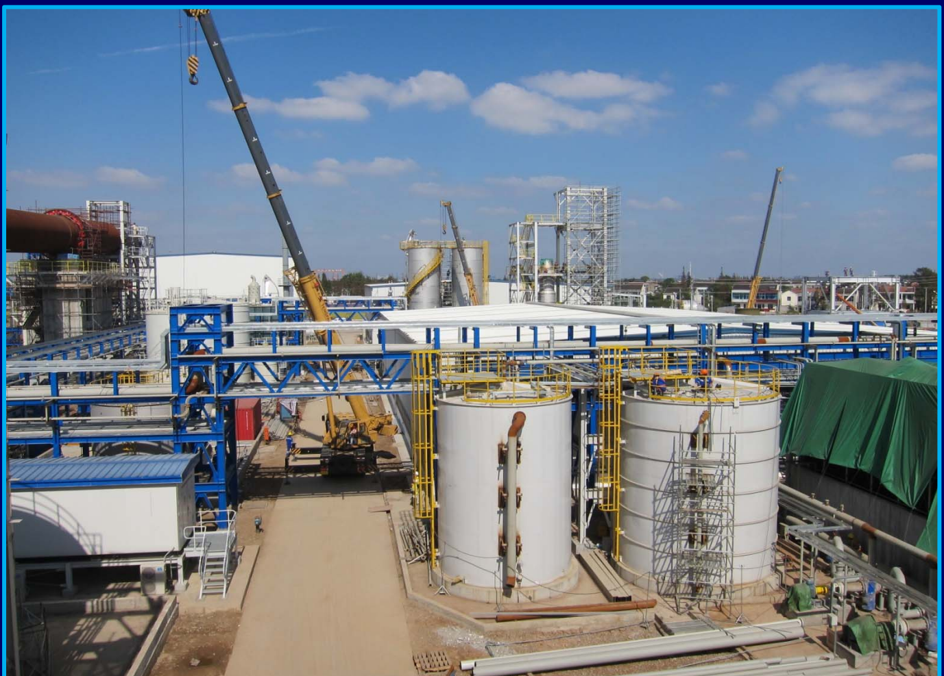
Process water tanks