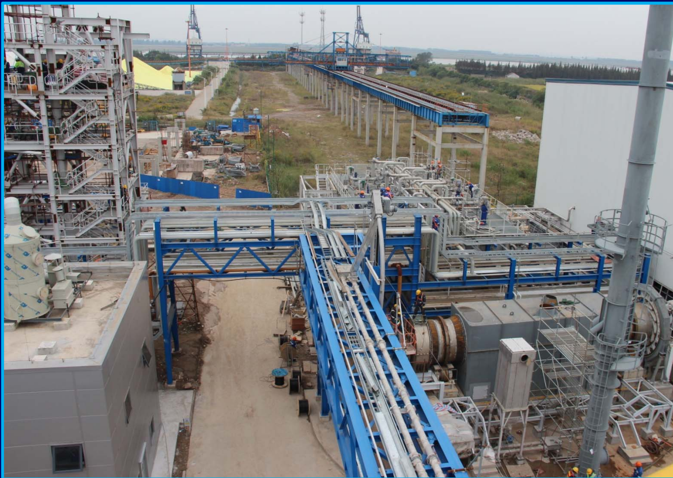
Final product dryer