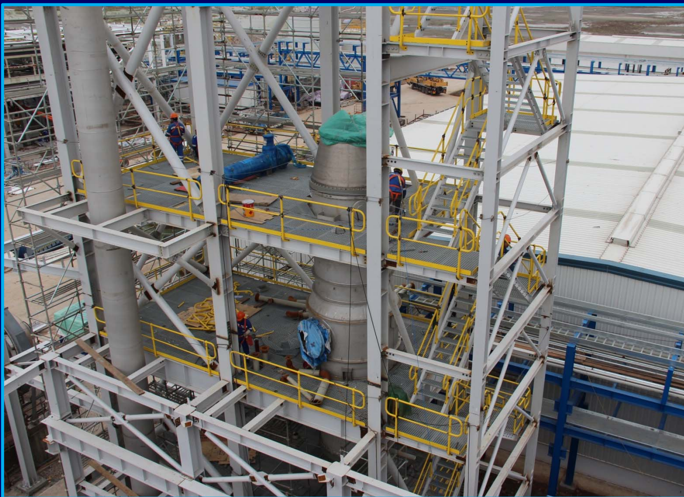
Sodium sulphate flash crystalliser