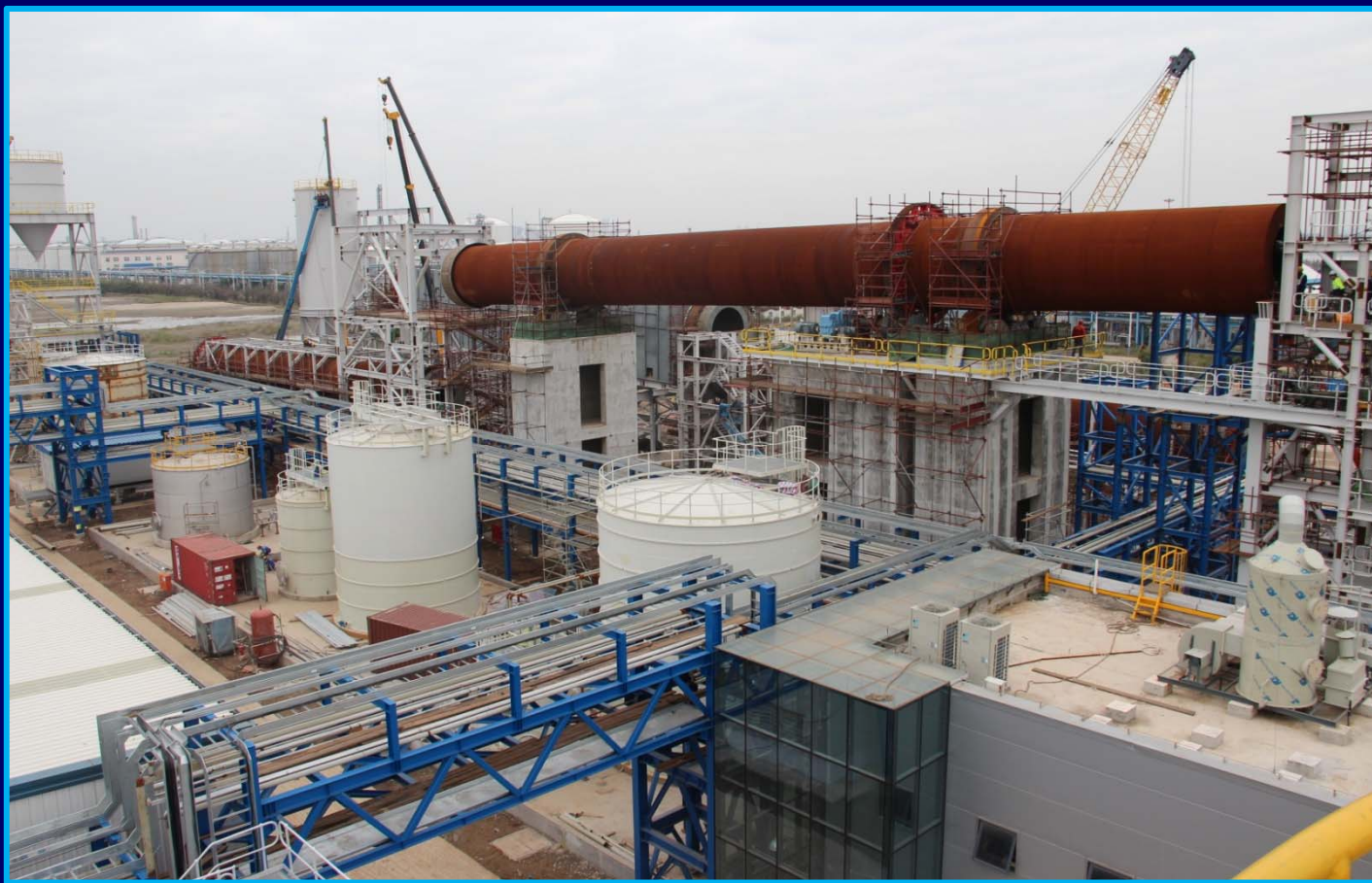
Area 20 – Calcination kiln background, laboratory building in fore ground