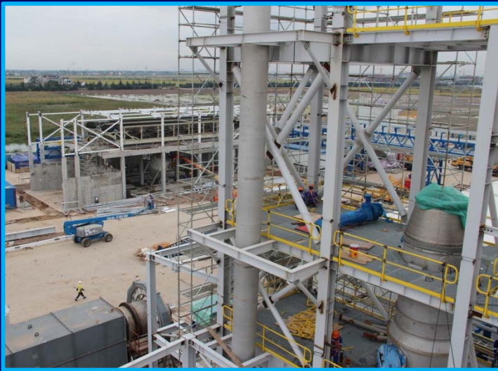
Sodium sulphate production area