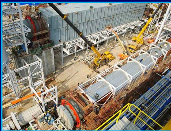
Area 20 - Calcination cooler