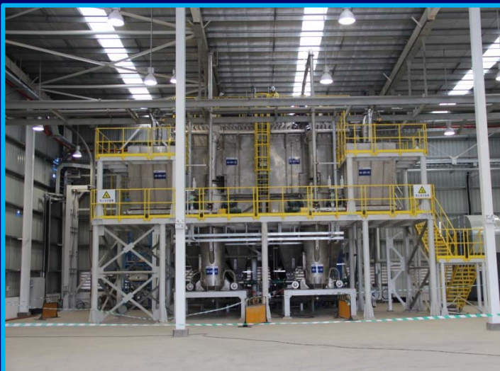
M iconiser unit