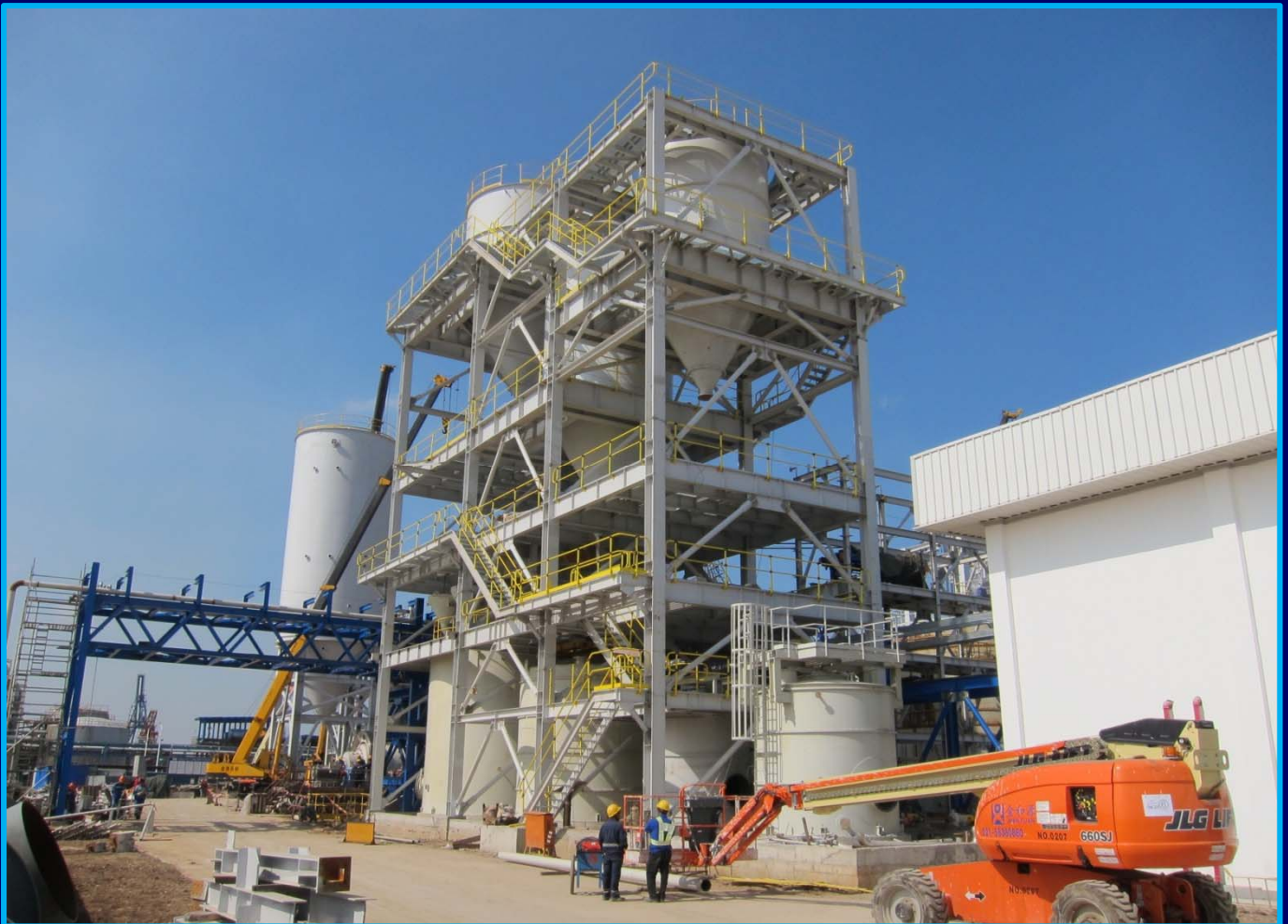
Reagents receival and storage area