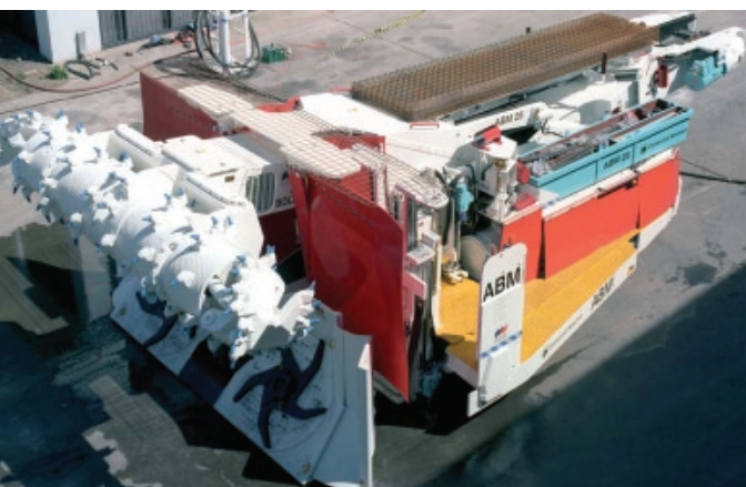
Pike's additional leased ABM20 continuous miner

Pike River has taken steps to improve the mine's ability to achieve the current year's production target of approximately 620,000 tonnes of saleable coal by contracting additional mining equipment and contract labour and hiring additional mining staff. Achievement of this target will be dependent upon roadway advance rates.