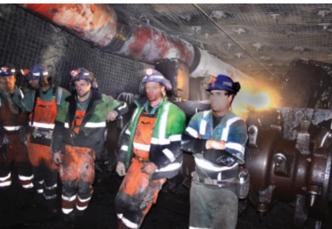
Pike miners alongside excellent roof conditions