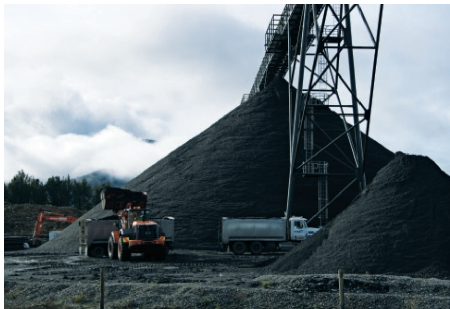
Coal being loaded for second export shipment

Pike River is preparing for its second export shipment of 20,000 tonnes of hard coking coal which is now scheduled for August 2010, one month behind plan. Worth approximately NZ$6 million, this shipment will again go to Gujarat NRE – one of our life of mine customers - who use Pike River's coal to make coke, used in the steel making process. This second shipment of development coal will attract a slightly higher discount due to higher ash levels and it being a non-specification shipment.