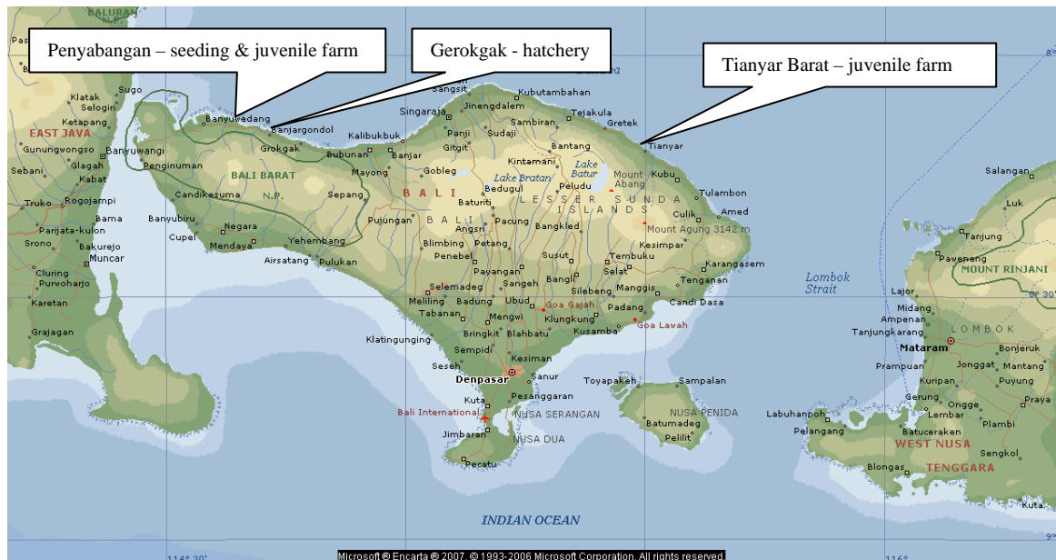
Map showing Bali and Lombok pearl farm/hatchery sites

The Company's acquisition of 9 farm sites and oyster inventories in the region of Flores and Alor in July will result in improved capacity which is expected to increase output by 100% when these farm new sites become fully operational. These sites have a record of producing good oysters and with the introduction of better seeding and farm management techniques, significant increases in productivity and efficiency in pearl production are expected. These new sites spread the geographical risks associated with water quality, environmental impacts, and security. The acquisition is still subject to approval from the foreign investment department of the Indonesian Government (BKPM).