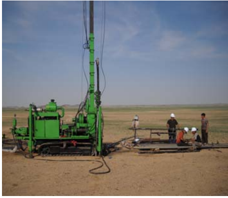
Drilling at Unst Khudag Coal Mine