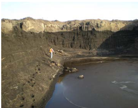
Unst Khudag Mine Coal Test Pit

government authority has approved the mining of 98.7Mt of coal.