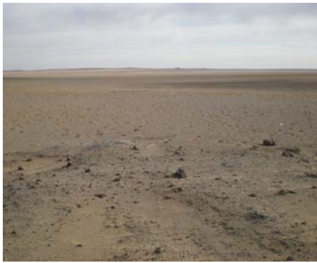
Unst Khudag Coal Deposit