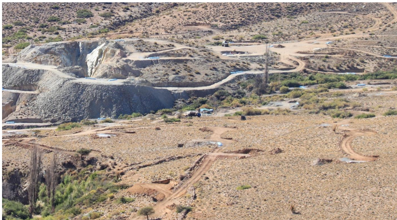
Figure 2 Llahuin Project Central Porphyry showing old workings and Higher Grade Core Area