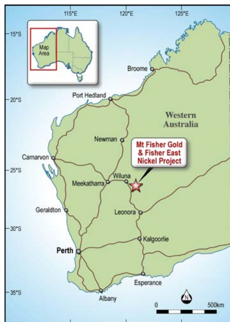
Figure 1: Project Location