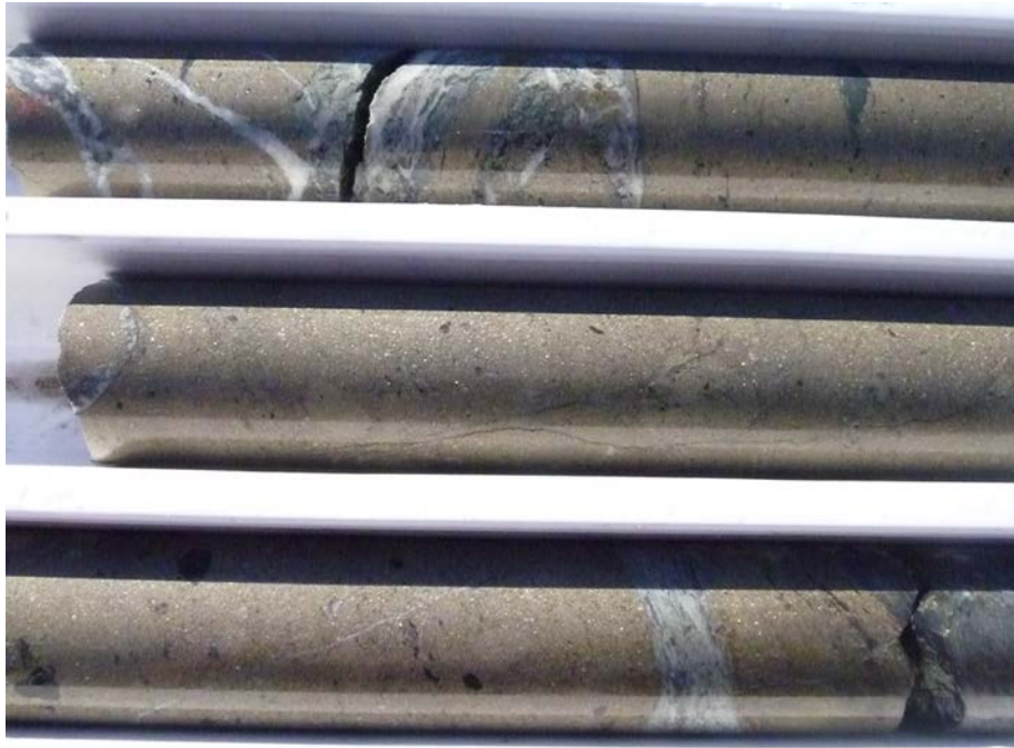
MFED026: Massive Sulphides ~483m