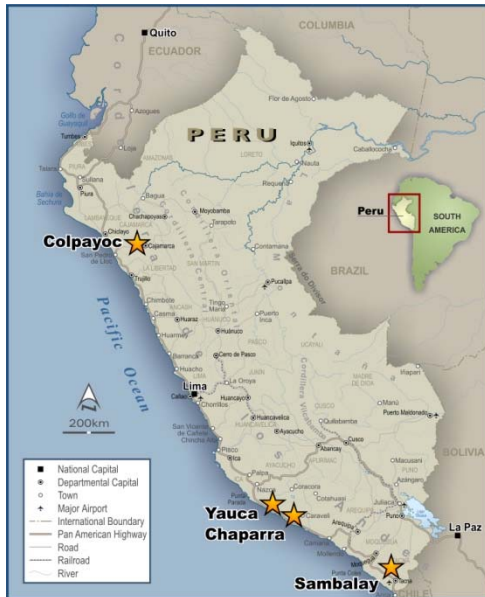
Figure 2: Location of Chaparra Project, Peru.