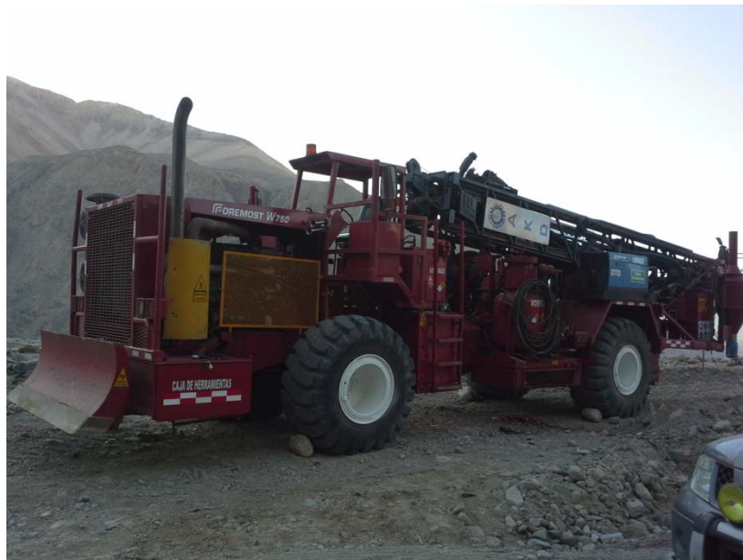
Figure 1: RC Drill rig on site at Chaparra IOCG Project, Southern Peru.

The Reverse Circulation (RC) drill rig has arrived on site with drilling company AK Drilling International SA providing drilling services. The drilling program of up to 3,000 metres will test key targets identified from regional and ground magnetics which have subsequently been interpreted using gravity surveys (figure 4).