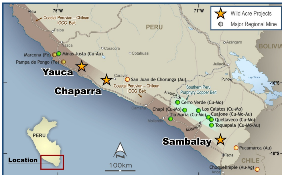
Figure 2: Location of the Chaparra Project – Peru

The larger western gravity anomaly covers an area of 4.8 kilometres by 2.8 kilometres. A break in the gravity high trend divides the anomaly into two distinct regions. This NE striking corridor of lower response is also recognized from the magnetic survey. This area is considered to represent a possible conceptual porphyry style target based on the general circular outline displaying complex variation of magnetic intensities that appears to be bounded by NE and NW structures. Both surveys (magnetics and gravity) were regional in design so detailed features will not be resolved well. The top to the anomalous magnetic source response has been modeled to approximately 200 metres whilst the underlying broader anomalous gravity response is modeled at depths from 400 metres below the surface.