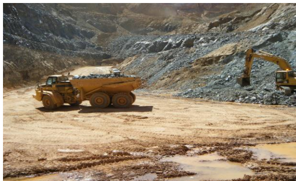
Figure 1: Celtic Pit undergoing clean-up operations in readiness for grade control drilling 2010

In 2010 the Celtic pit floor was dewatered in order to assess the grade control of the resource.