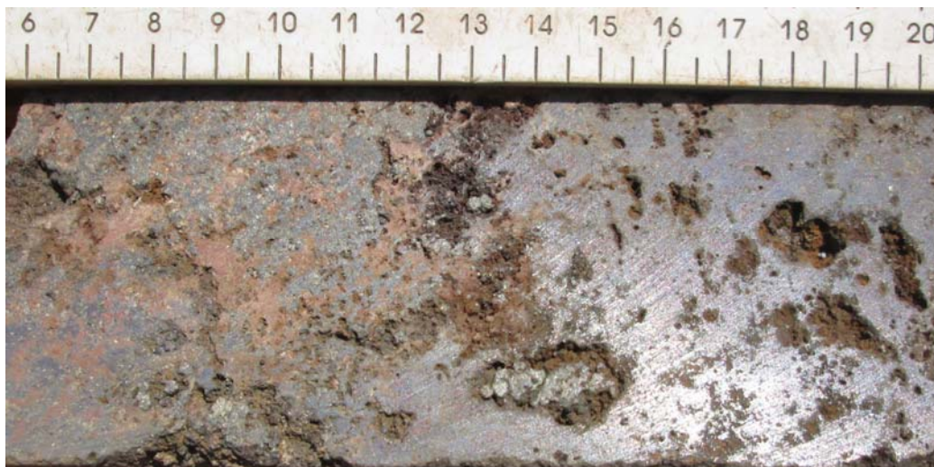
Figure 1. Massive chalcocite mineralisation intersected at 277.8m in KITDD-028