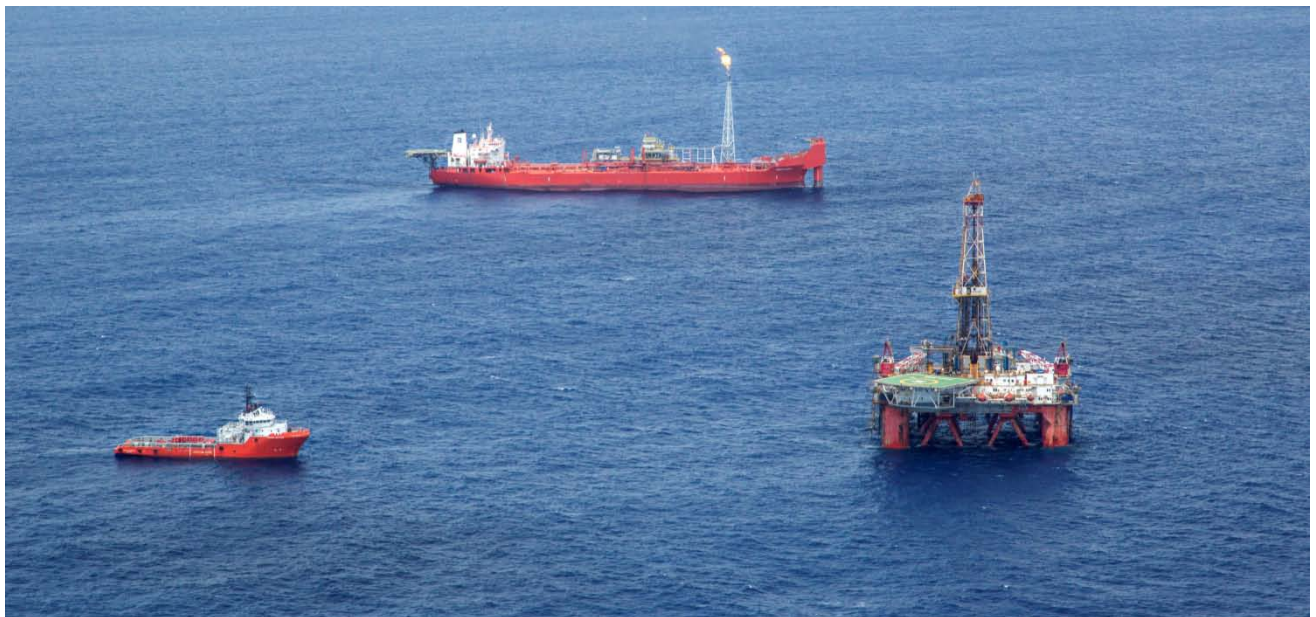
Figure: FPSO Rubicon Intrepid and MODU Ocean Patriot in operations in the Galoc oil field, June 2013

Media: Dudley White MAGNUS Investor Relations + Corporate Communication +61 2 8999 1010 dwhite@magnus.net.au