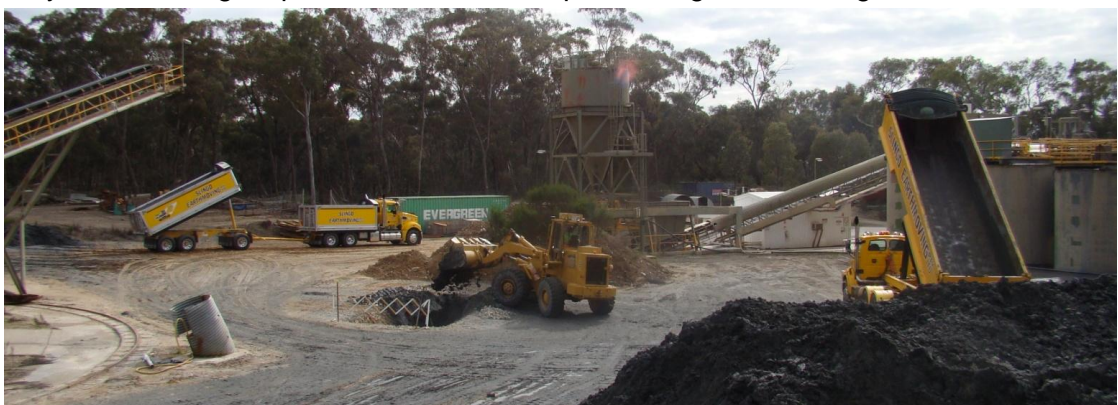
Trucks delivering Kangaroo Flat tailings to the Porcupine Flat Gold Processing Facility with the loader feeding the reclaim slot