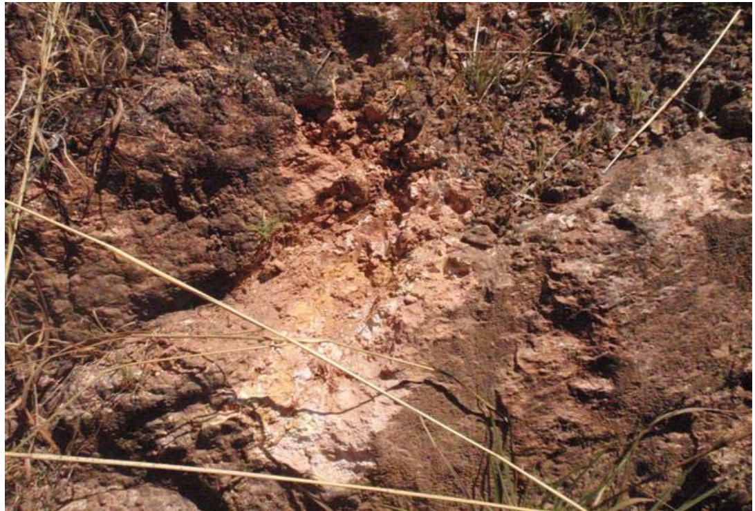
Figure 2 Geolsec rock phosphate deposit outcrops on a hill with no pre-strip required and with easy access by road which cuts across the deposit.