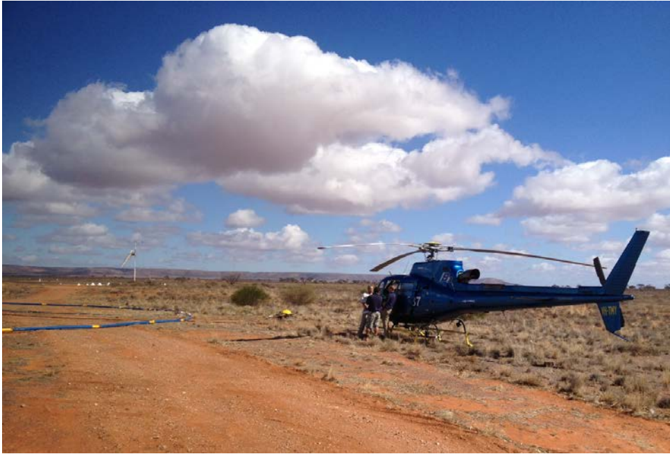
Helicopter at Port Augusta airfield - survey set up