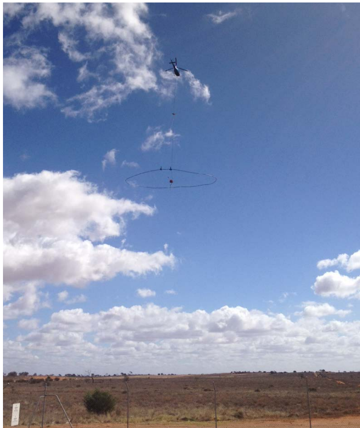
Scout line preparation at Port Augusta airfield - systems check