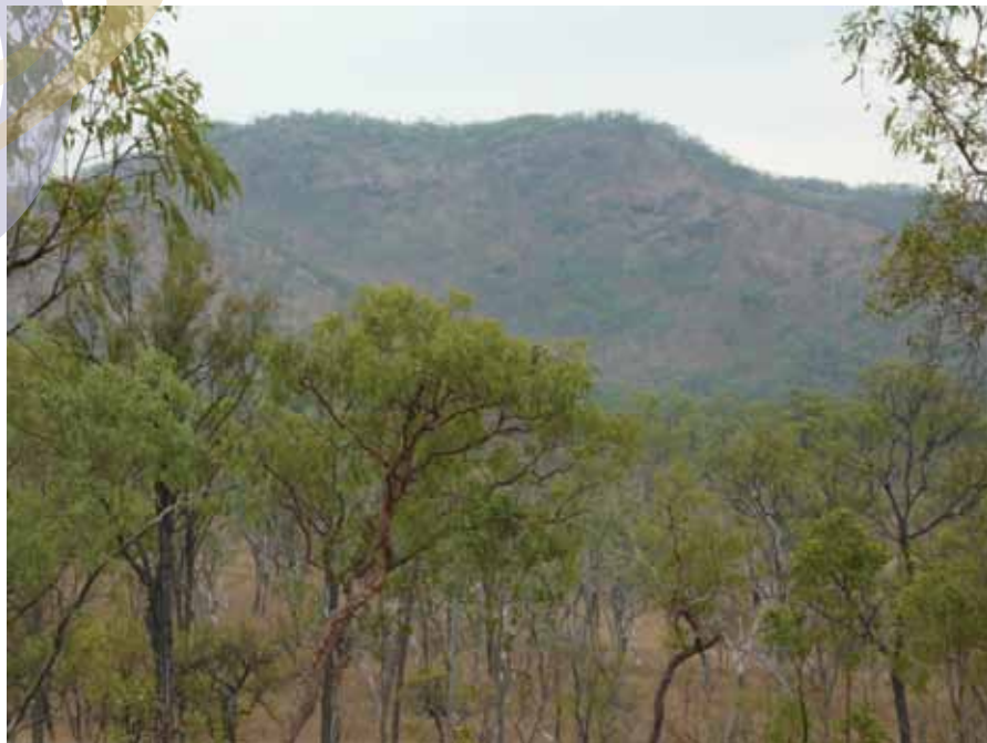
Mount Borium Landscape

A notification letter from the relevant Government Department has indicated that all three tenement applications have now proceeded to the grant stage. Planet has paid its required rental fees and financial assurance and expects official tenure to be granted within weeks. Fieldwork will commence soon after official grant.