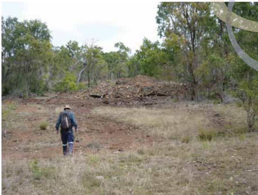
Appletree Prospect - Mt Cannindah Cu-Au Project

During the quarter, Drummond Gold Limited finalised an advanced technical study into the project based on a recently completed database compilation. High level modelling using all geological data and geological information has generated proposed drill targets around the Cannindah East Structure and the Multiple Skarn system in the southern end of the Mining Lease and further south into the EPM. Site visits are planned in the June quarter to assess such targets.