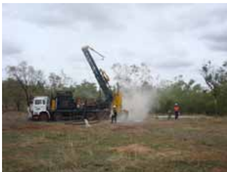
Torchlight Drilling December 2011

As per ASX Release dated 2 February 2012, Planet Metals reported that no significant results were received from a 1,086m scout reverse circulation drilling program completed in December 2011. Planet Metals completed its minimum obligations with respect to its farm-in agreement with Callabonna Uranium and decided to subsequently terminate this agreement. Further details are contained in ASX release dated 26 March 2012. The Board and Management of Planet have taken the view that the Mount Borium and Oak River projects offer better exploration prospects.