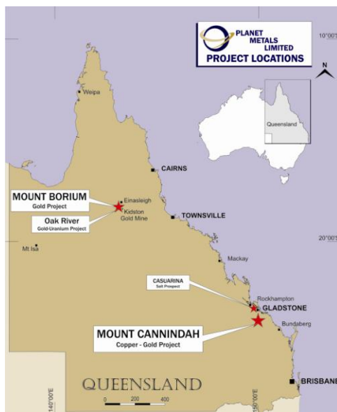
Project Location Map

Planet Metals (ASX Code: PMQ) is a Brisbane-based ASX-listed resource and exploration company, with a focus on gold and copper in Queensland. The Company's key operations are the Mount Cannindah copper-gold project (subject to a farm-in agreement with Drummond Gold) and the Mount Borium gold project (located between Kidston and Einasleigh, Qld). Planet Metals has 59.7 million shares on issue as well as 9.5 million unlisted options. As at 30 September 2012, the Company had cash at hand of $1.85 million.