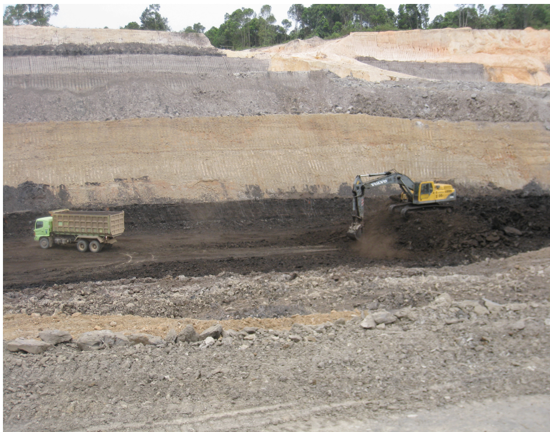
Plate 1: Photograph showing coal being extracted from the present mine pit bearing coal of minimum calorific value of 5100 Kcal/kg whilst stripping of overburden at another exposed coal seam is being carried out at the further end of the mine pit.

The Company plans to carry out the next phase of exploration to explore the coal resources in the remaining 691 ha of the Abadi Concession in year 2012. The Company is finalising its plan to raise the necessary capital for such purpose and the appropriate announcement will be made in the near future.