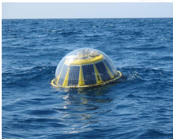
Carnegie's wave measuring buoy off Bermuda.