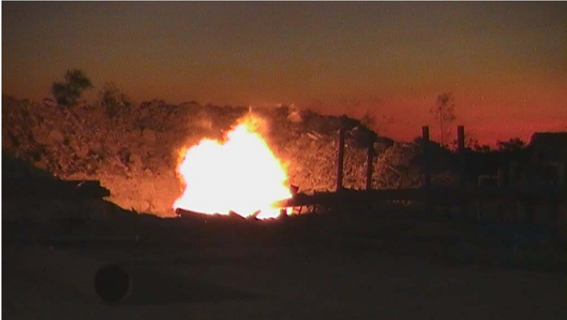
Figure 3: Gas Flare during Drilling with Compressed Air at Glyde #1 Lateral Well Measured Well Depth of circa 770m