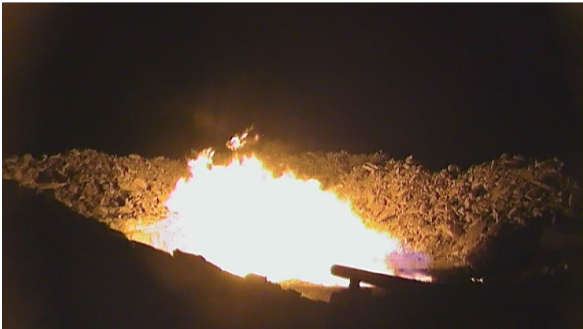
Figure 1: Gas Flare during Testing at Glyde #1 Lateral Well Measured Well Depth of circa 670m

Drilling of the Glyde #1 lateral well has progressed to a measured depth of 810m with the well orientated close to a horizontal trajectory. The well has intersected the estimated down hole location of the historic 1979 GR-9 mineral exploration core hole in the Barney Creek Formation at 695m measured depth and has continued to maintain gas flow rates whilst drilling to 810m.