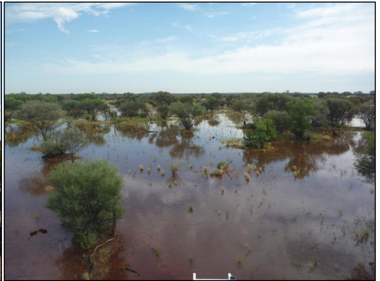
Figure 2 Flooding over Kumarina tenement