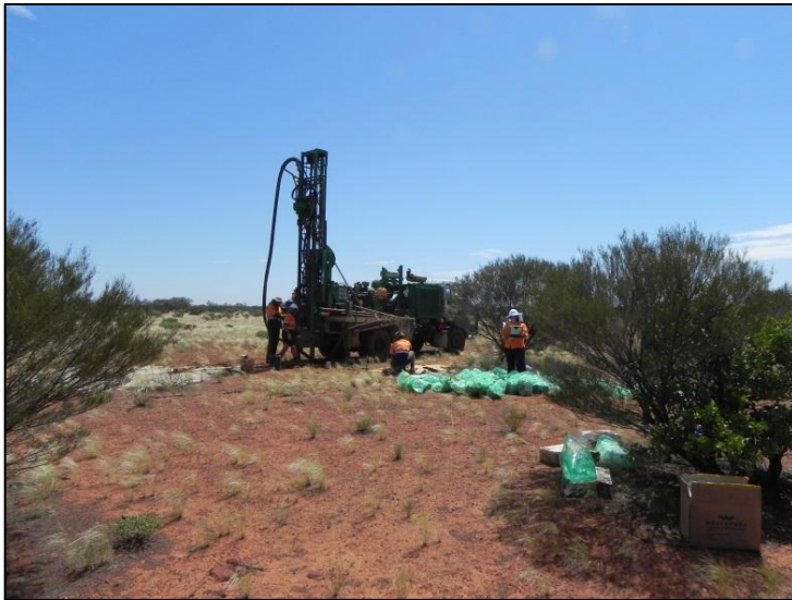
Figure 1: Aircore Rig Kumarina