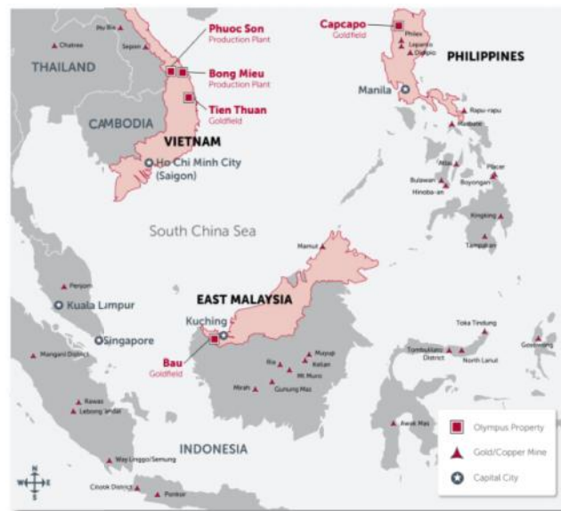
Southeast Asia Regional Map

Olympus Pacific Minerals Inc. is a Canadian company with international operations involved in the exploration, development and mining of mineral properties in Southeast Asia, with a focus in Vietnam, Malaysia and the Philippines. The Company, a first mover in Vietnam, is building its base with the aim of being a leading gold producer and explorer in Southeast Asia and has commissioned the first two foreign owned gold mines and processing facilities to be operated in Vietnam since the 1940s. The management team is strongly committed to Olympus' vision of making major discoveries in the region and increasing shareholder value. The Company focuses its activities on four multi-project properties, two located in Central Vietnam - the Bong Mieu Gold property and the Phuoc Son Gold property, one located in Malaysia - the Bau Gold project, and one located in the Northern Philippines - the Capcapo Gold/Copper property.