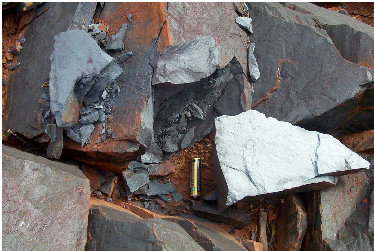
JWD DSO Hematite