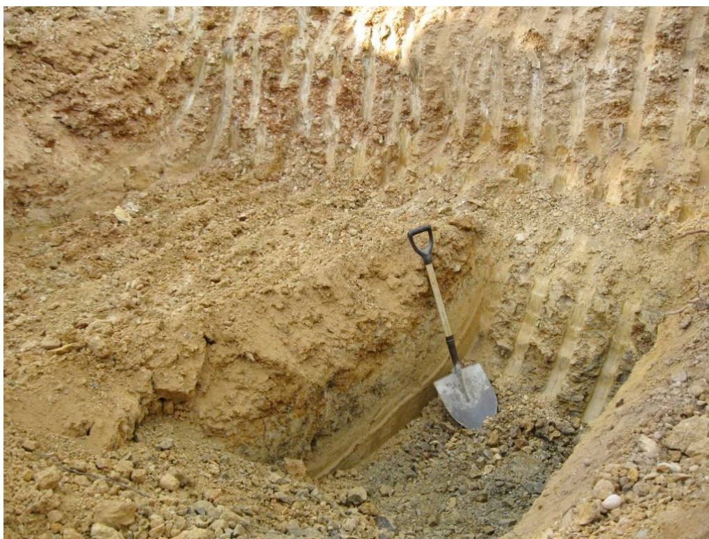
Sample B-BH-1 was taken from the upper portion of the pit.

Sampling was by excavator over a vertical interval of 1.5 metres. Location is 0256631E 6692545N (GDA 95). The sample was trucked to Copeton for crushing to 10 mm, processing through the Company's trommel and jig plants, using a screen size of 1.2 mm. Nine out of ten tracers were recovered. Separation from concentrate was by grease table. Weight of sample was determined by weighbridge.