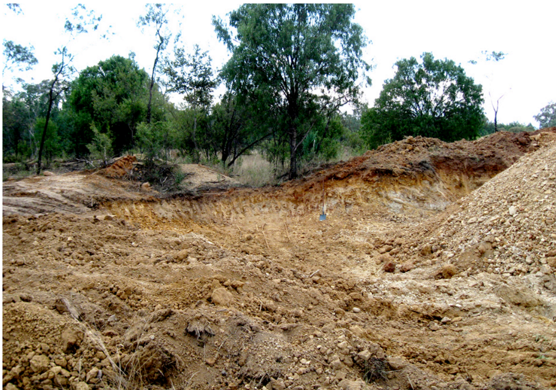
Sample B OD 8 was taken from the pit edge at centre right. Note the railway tracks (centre) oriented towards the washing dam.