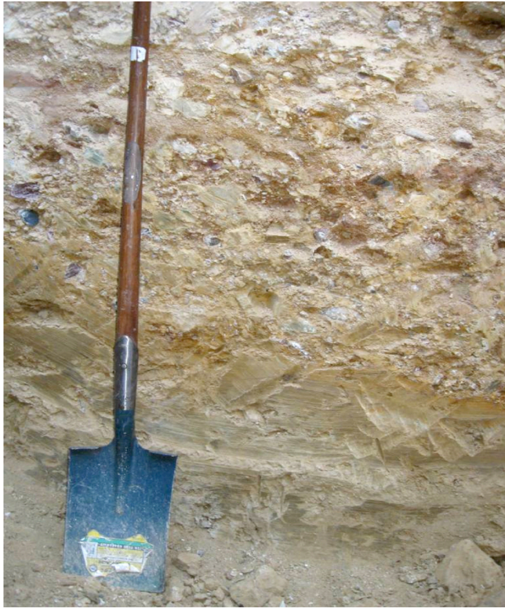
Base of Sample B BH 9 above (at top of shovel blade).