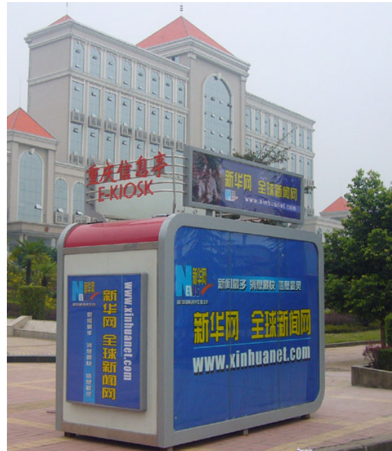
e-Kiosk Located in Government Square Hechuan District

In September 2007 the project went live with the roll-out of the first operational e-Kiosks using software and services developed with the assistance of Nantian.