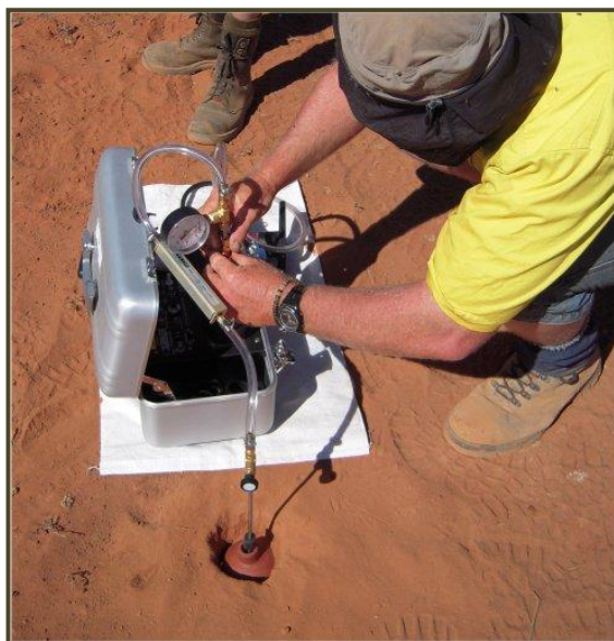
Left: Radon survey being conducted by Marmota Energy field staff.