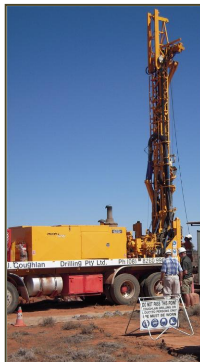
Above: Drilling at Mulyungarie project by Marmota Energy

"Drilling completed to date by Marmota has confirmed the presence of the uranium prospective Eyre and Namba Formations within the project."