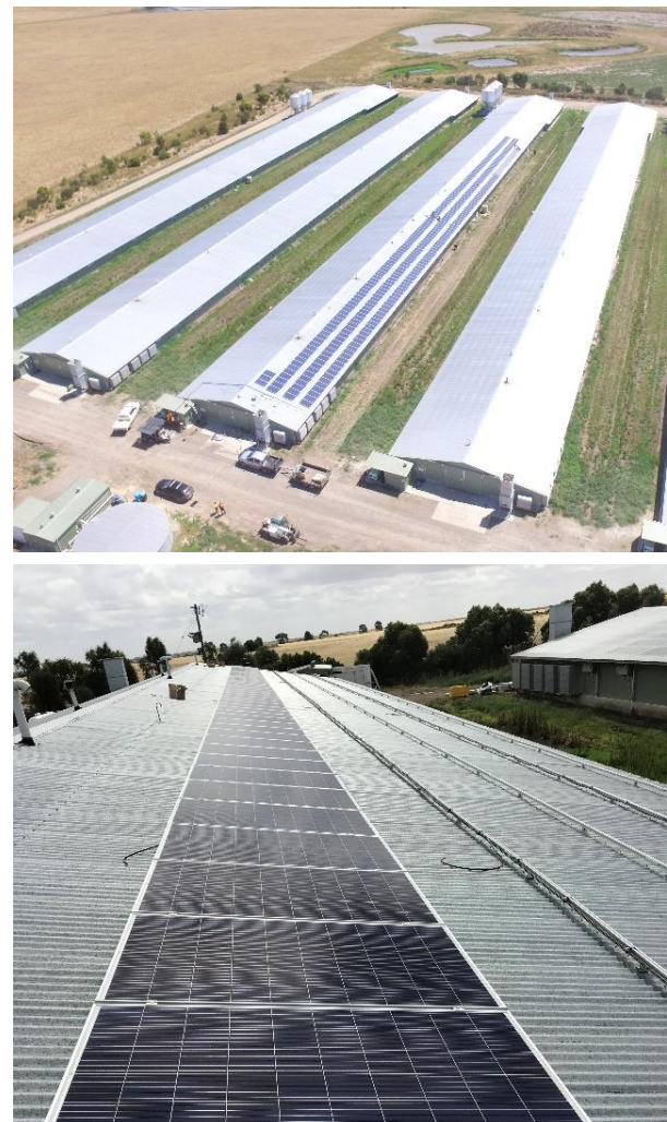
Lethbridge, Victoria, January 2018 (top image) and December 2017 (below image)