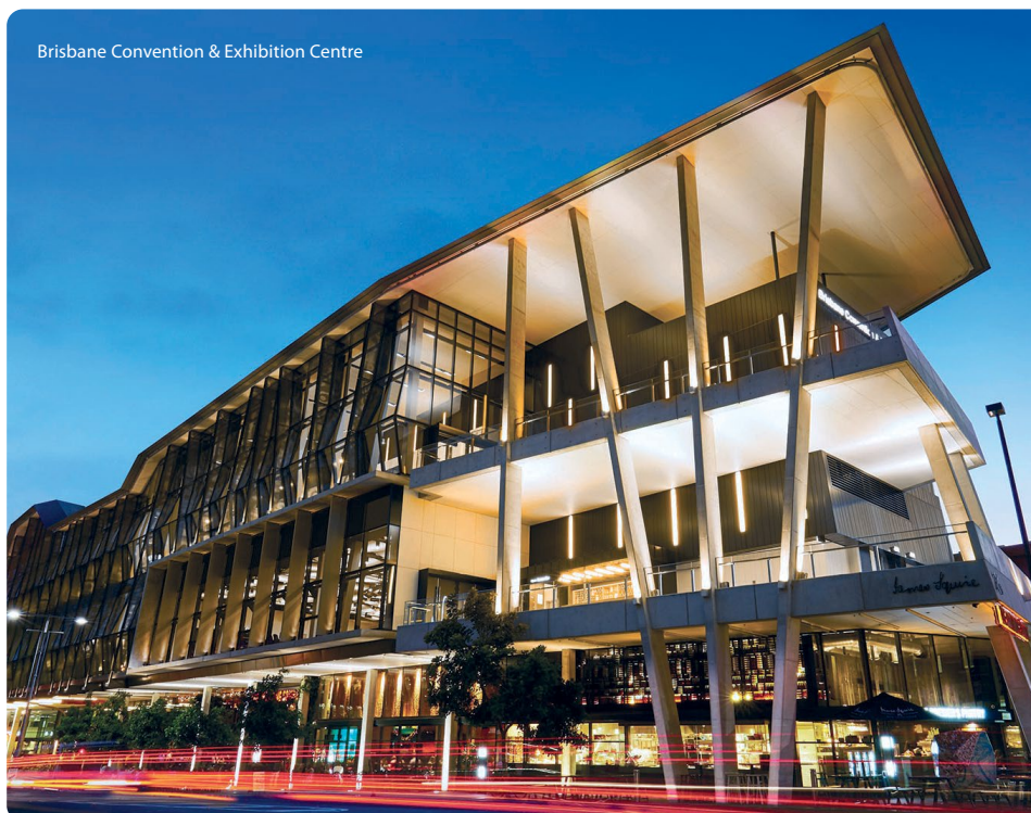
Brisbane Convention & Exhibition Centre