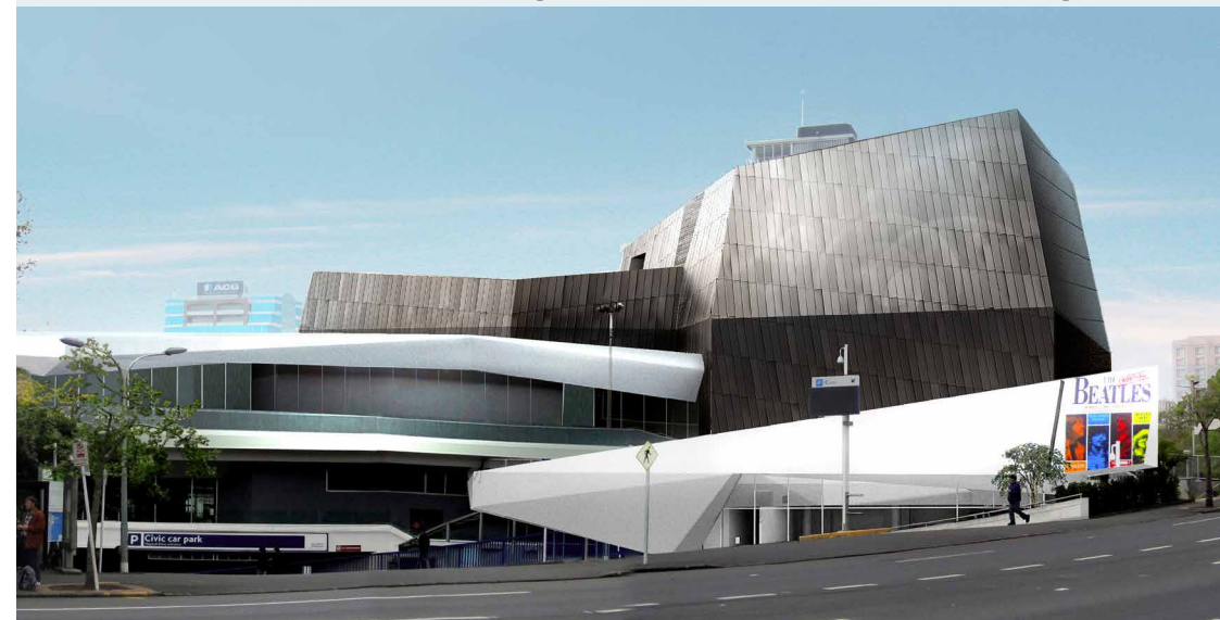
Artist's impression of Aotea Centre after the refurbishment with paladin