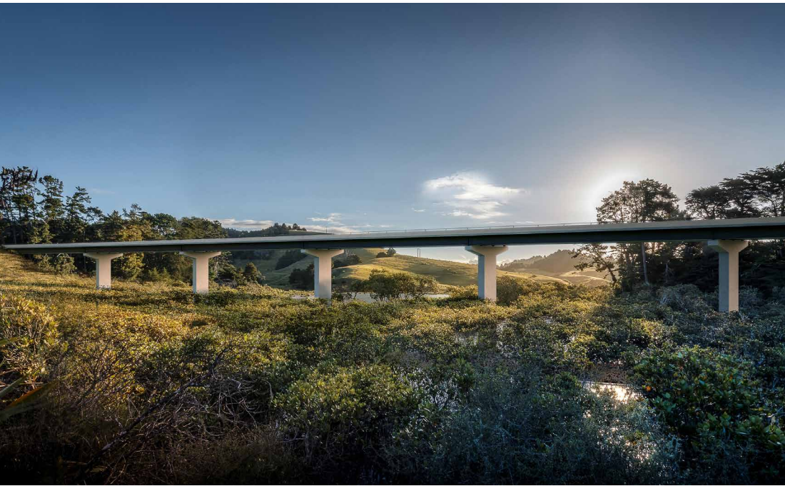
Artist's impression of the new Okahu viaduct