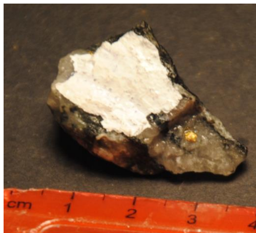
Figure 1: Visible Gold from rock samples collected during shaft sinking