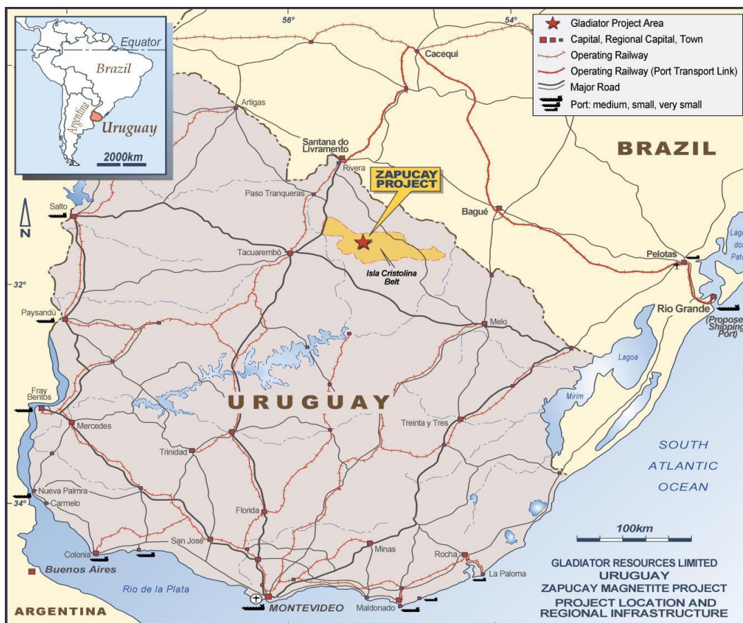
Figure 1: Location of the Zapucay Project and the Isla Cristalina Belt (ICB) in Uruguay