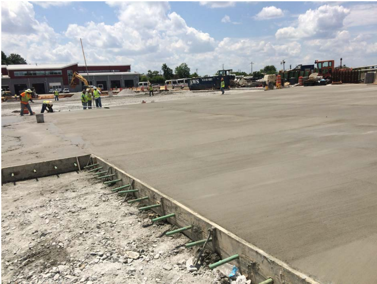
Figure 2. EdenCrete™ enriched slab being installed

As previously announced, two independent test laboratories in Georgia each took test samples of both the standard concrete and the EdenCrete™ enriched concrete. The results reported from each of the two laboratories are shown in Figures 3 and 4 below.