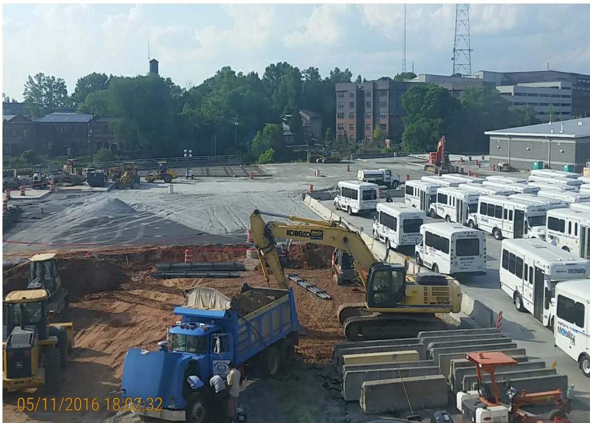
Figure 1. Brady Mobility Facility with EdenCrete™ slab site being prepared (shown in upper left)

The results produced from these tests are considered to support this assumption.