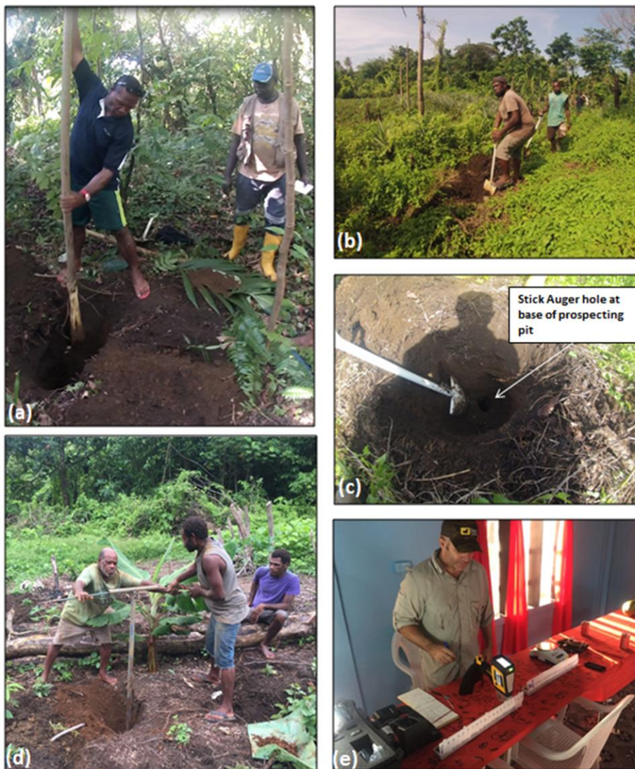
Figure 4" (a) Stick Auger being used for sampling bauxite profile. (b) Land Owner assisting prospecting on his own farm. (c) Stick Auger hole at bottom of hand dug prospecting pit. (d) Conventional Hand-Auger sampling. (e) Field analysis using hand-held XRF.

will be engaged by Iron Mountain for the provision of ongoing landholder, government relations and project generation.