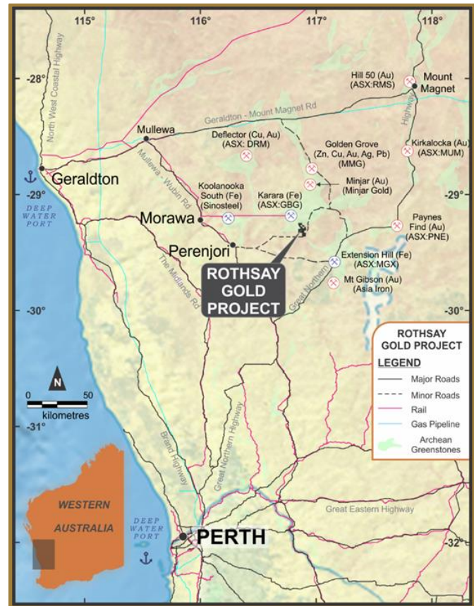
Figure 3 - Rothsay Gold Project Location

EganStreet acquired the the Rothsay Gold Project in 2011, has completed 2,200 metres of diamond drilling and in 2016 commissioned Cube Consulting to complete a Mineral Resource Estimate (see Table 1).