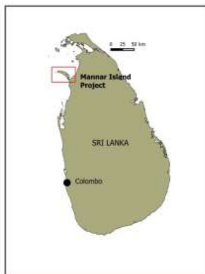
Figure 1 Mannar Project area, pre 2016 and current Srinel Holdings Ltd auger drilling.