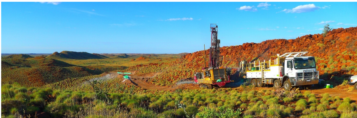
Figure 2: Drilling at the Lynas Find Lithium Project, looking NNE