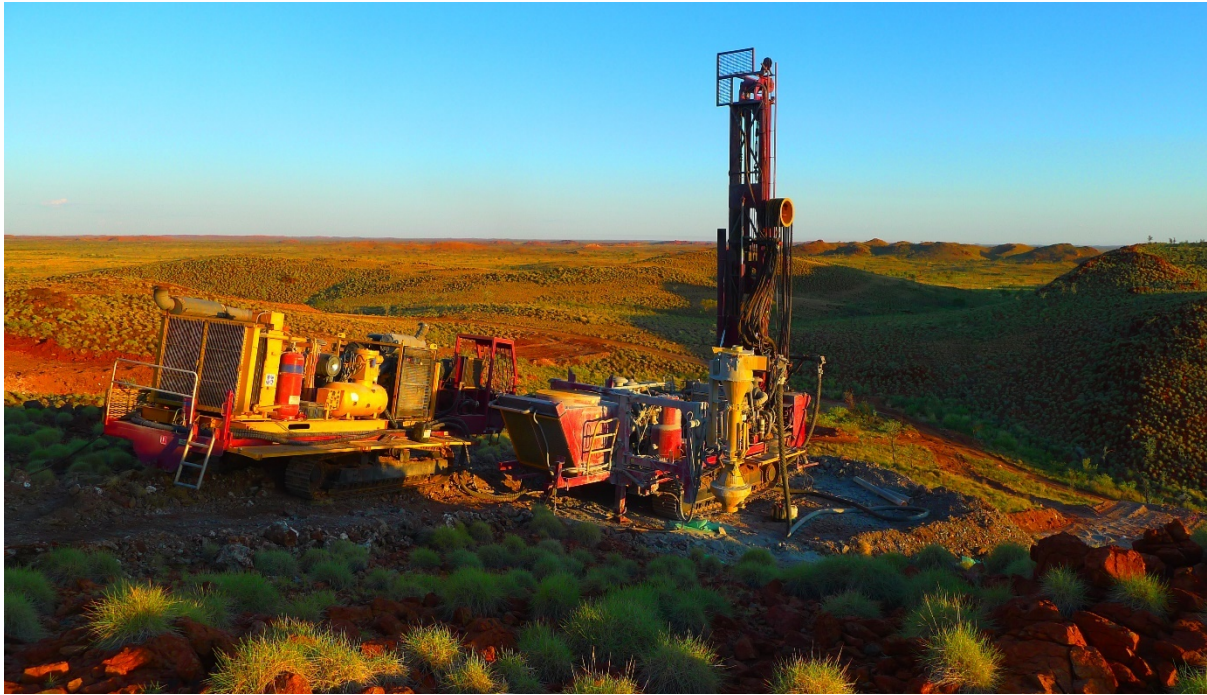
Figure 1: Drilling at the Lynas Find Lithium Project, looking NW