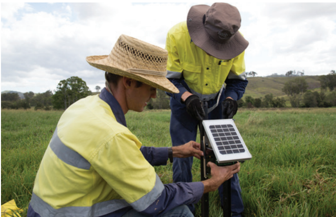
Libelium sensors being installed at site for integration with the EnviroSuite software platform

The trial involves soil moisture sensors installed in a wastewater irrigation area as the basis of a real-time operational tool to guide management in turning irrigation systems on and off using soil moisture as a key indicator. Management of soil moisture in wastewater irrigation is essential for the protection of groundwater from nitrate contamination.