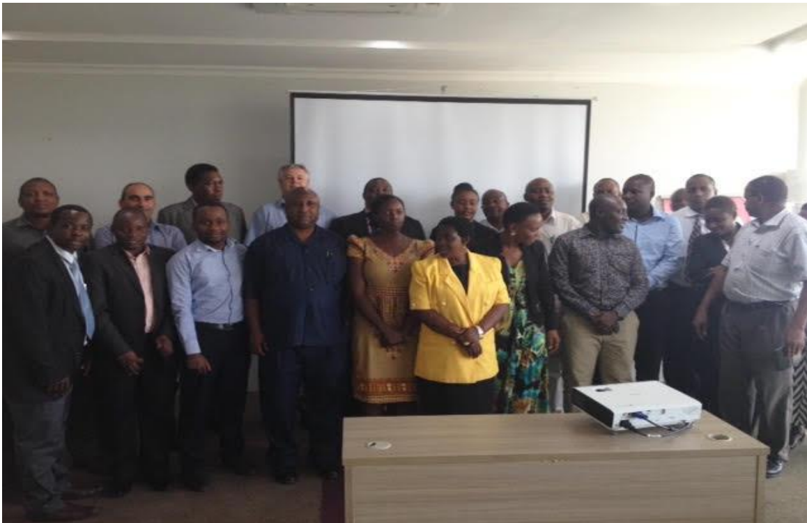
Figure 1 – Magnis Resources representatives and members of the Tanzanian Government Negotiation Team

"I would also like to thank our team in Tanzania who have proven time and again that they can deliver major milestones in a very tight time frame."