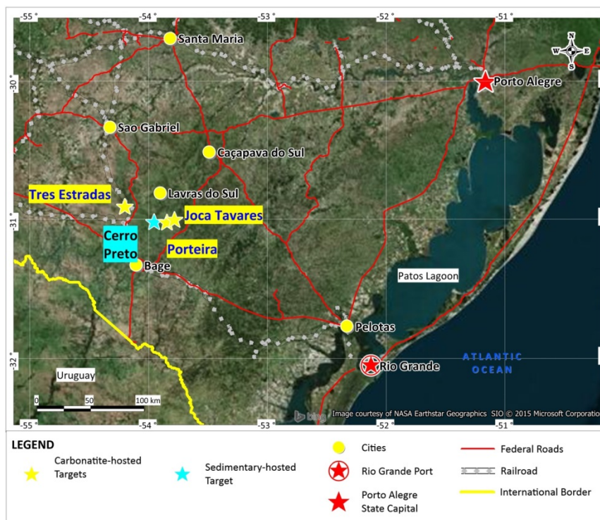
Figure 1: Rio Grande Tenement Map and Key Prospects – Refer to Tenement Register for Licence Details

Southern Brazil is a major farming region which currently imports 100% of its phosrock requirements. There are currently no phosphate mines in the region and none scheduled to be built in the foreseeable future other than Aguia's planned development of Três Estradas. Aguia's landholding in Rio Grande do Sul currently totals about 38,289 hectares. Três Estradas is the most advanced of Aguia's holdings in the region which also includes the carbonatite-hosted Joca Tavares and Porteira Projects, and recently discovered sedimentary Cerro Preto Project. The region has well developed infrastructure with excellent roads, rail, power, port and utilities.