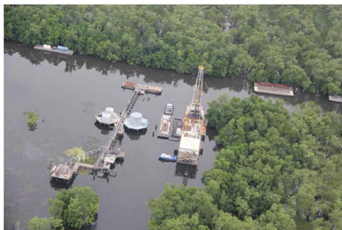
Williams No.2 discovery well: Barge drill rig next to production & oil storage facilities

Petsec: 25% working interest (18.75% net revenue interest)