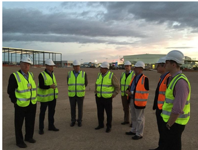
Lindsay Australia Board Members at the Direk Site's construction