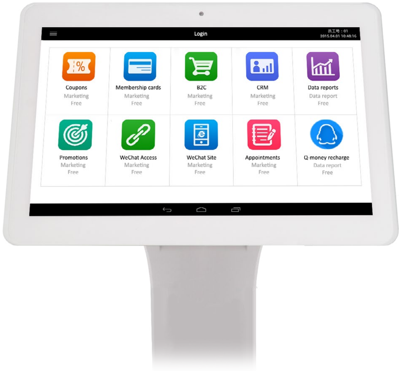
Example PRC merchants smart POS screen showing the functionality provided by TTG's Tlinx