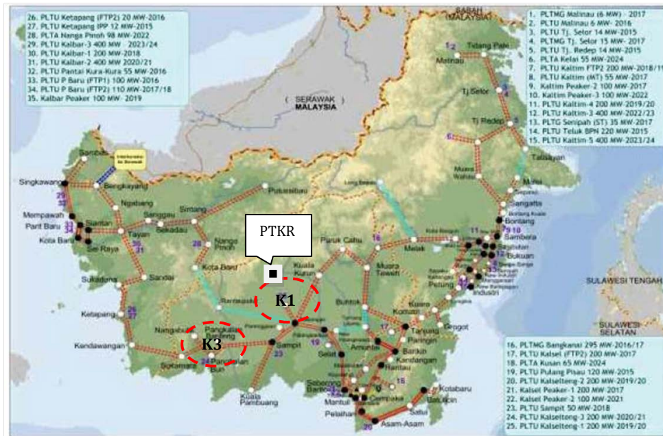
Figure 1: - Central Kalimantan Power Station Plan

Note: PTKR = PT Katingan Ria coal project; K1 = Kalselteng 1 200Mw power station proposal; K3 = Kalselteng 3 200Mw power station proposal