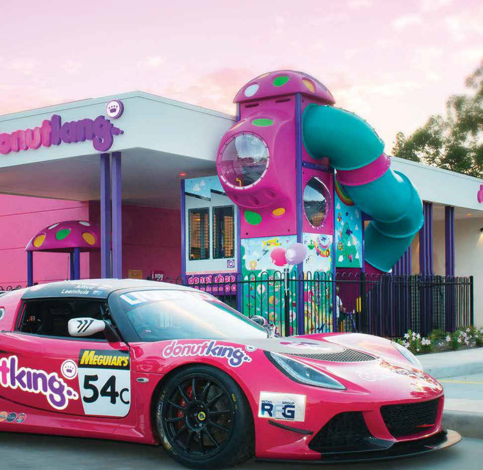
Inaugural Donut King Drive-Thru Outlet. Deagon, Queensland.