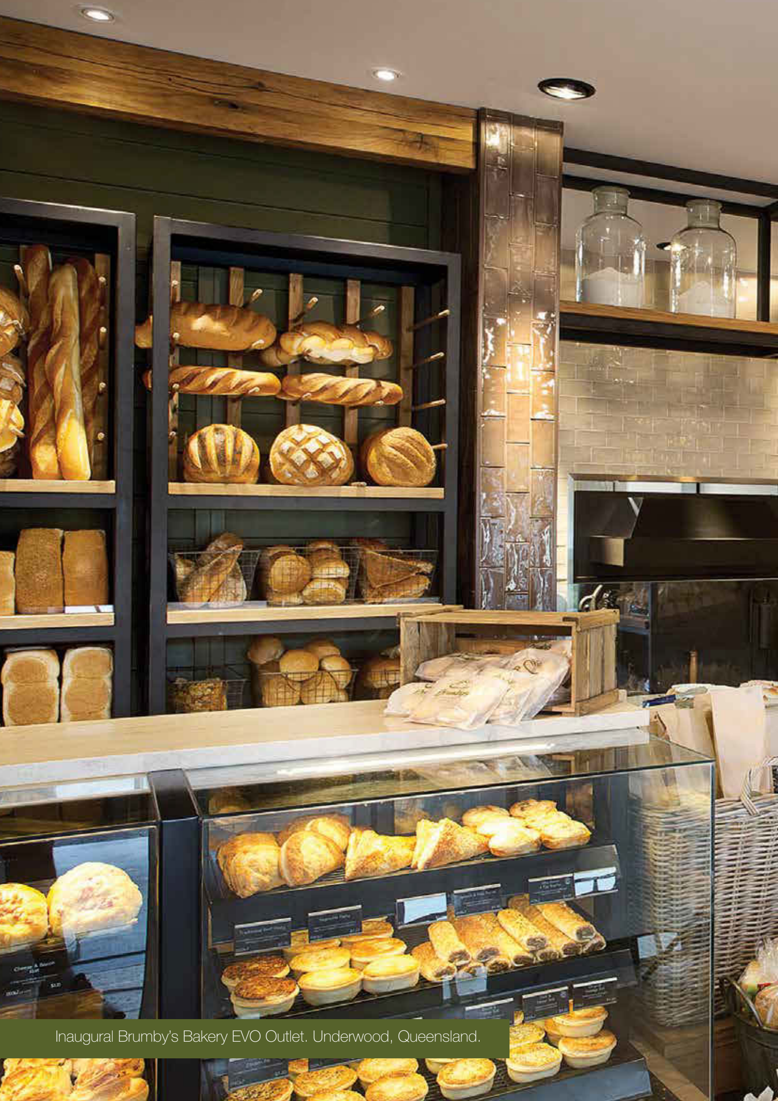
Inaugural Brumby's Bakery EVO Outlet. Underwood, Queensland.