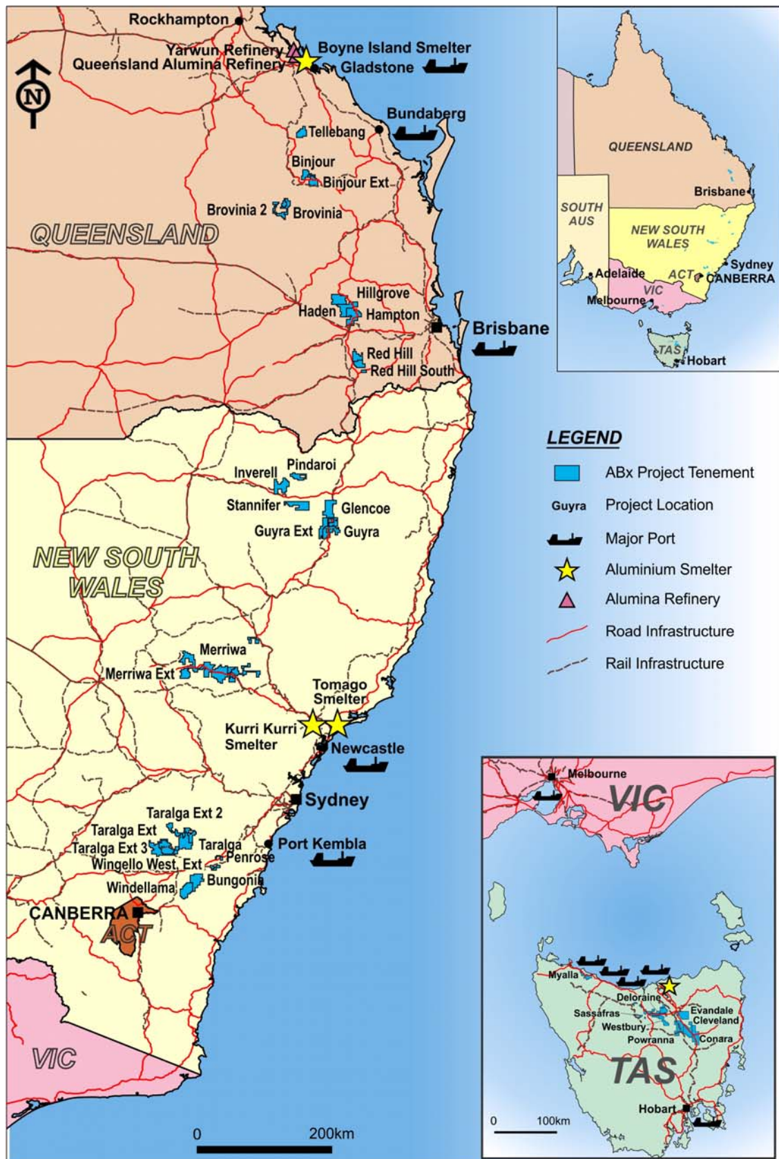
Figure 3: ABx Project Tenements and Major Infrastructure