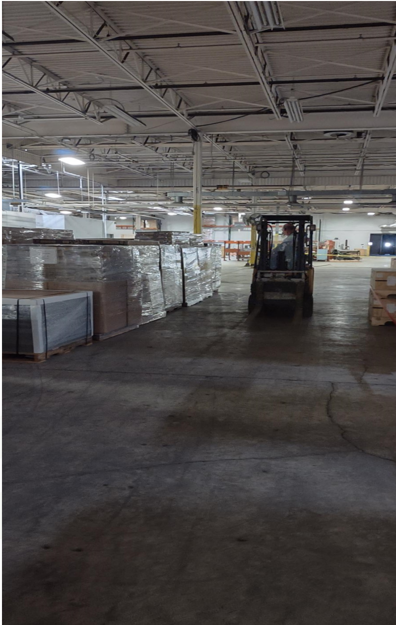
Figure 2: Dry Room construction materials have arrived in iM3NY Battery Plant