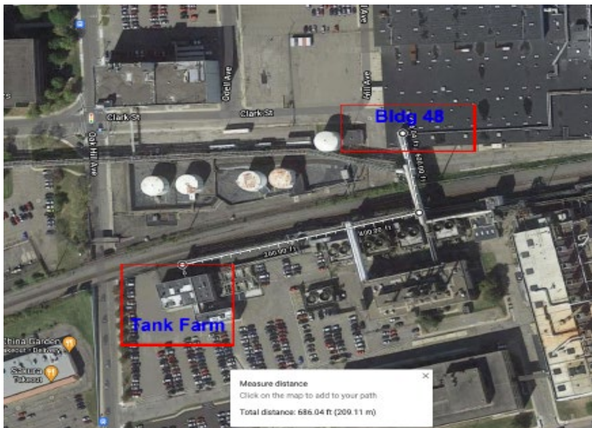
Figure 3: Tank Farm location and building 48 represent the Gigafactory site