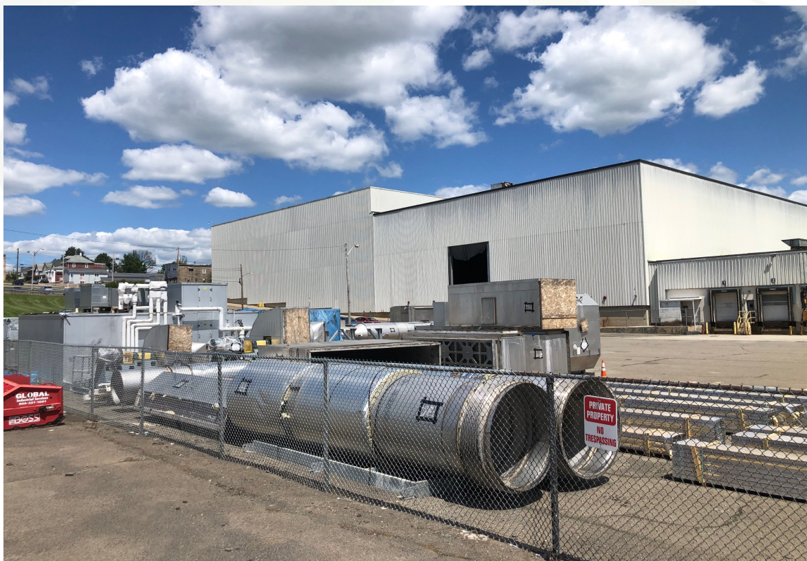
Figure 4: External Condenser Systems moved to final location